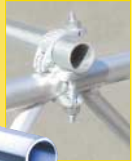
Node Point connection for maximum loading