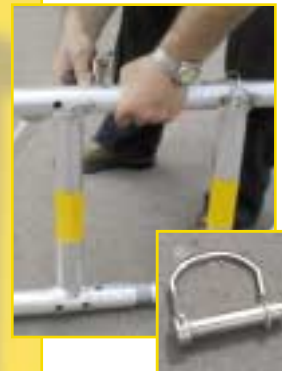
Spring Clips and Spigots for fast connection of beams