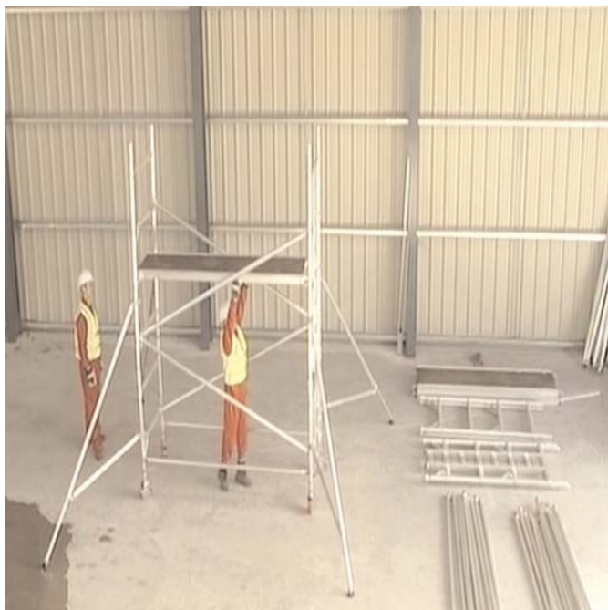
Figures 3 and 4 'Through the trap' (3T)

The 3T method makes use of standard tower components.