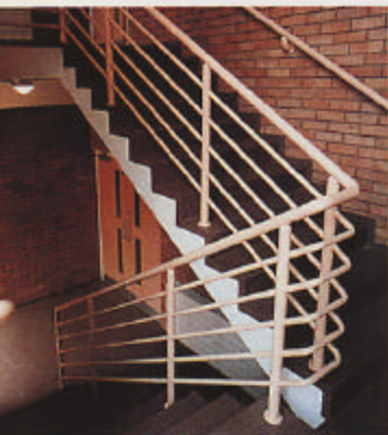
I Detail of Motherwell site.